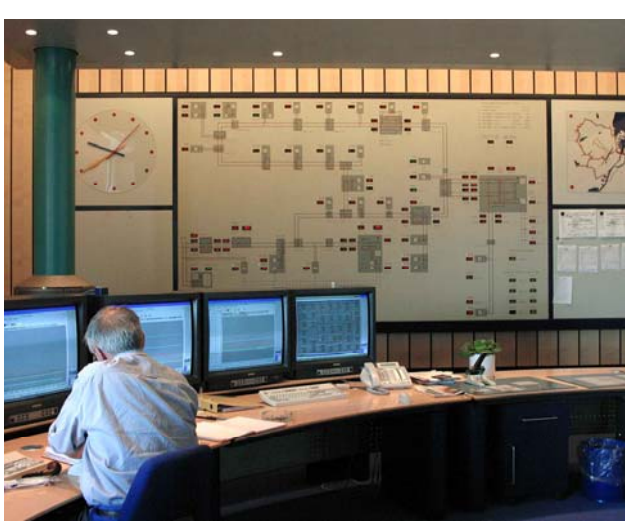
CTR's operation centre.